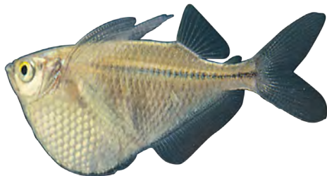
C1 = Carnegiella marthae - Gesreepte bijzalm