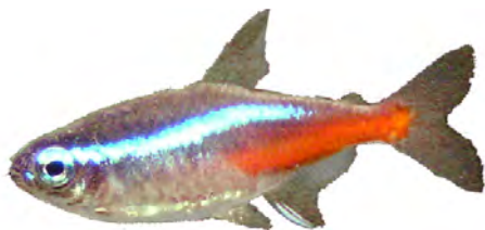
F2 = Paracheirodon innesi - Neon tetra