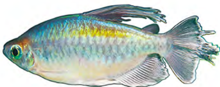
E6 = Phenacogrammus interruptus - Kongozalm