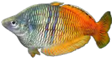
A4 = Melanotaenia boesemani - Regenboogvis