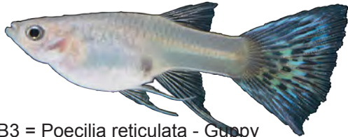
B3 = Poecilia reticulata - Guppy